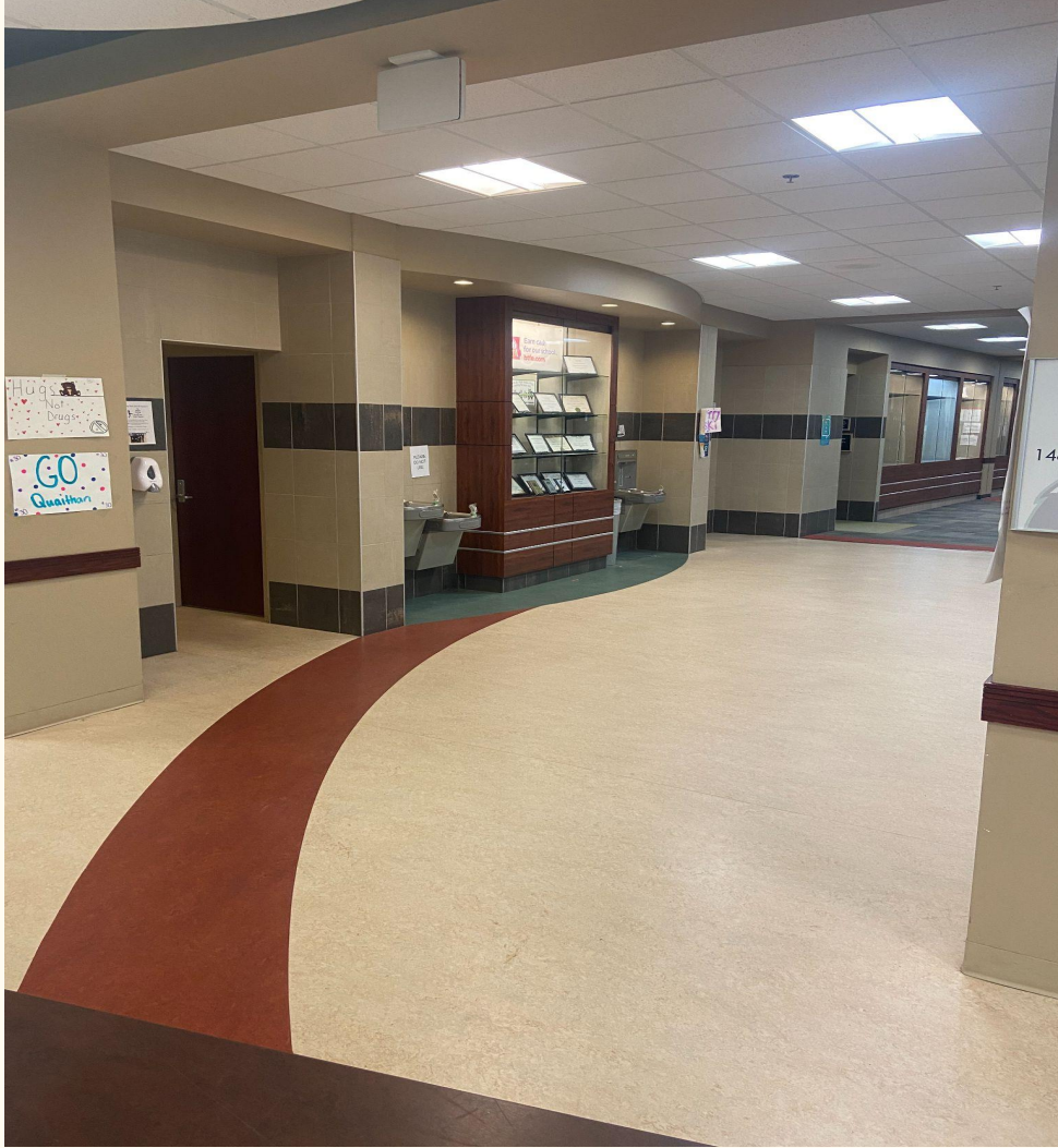
Outside the restroom by front office